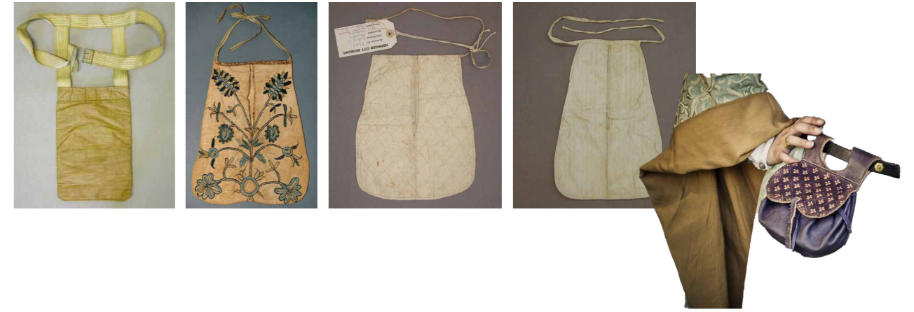
The Pockets of History Archive Collection