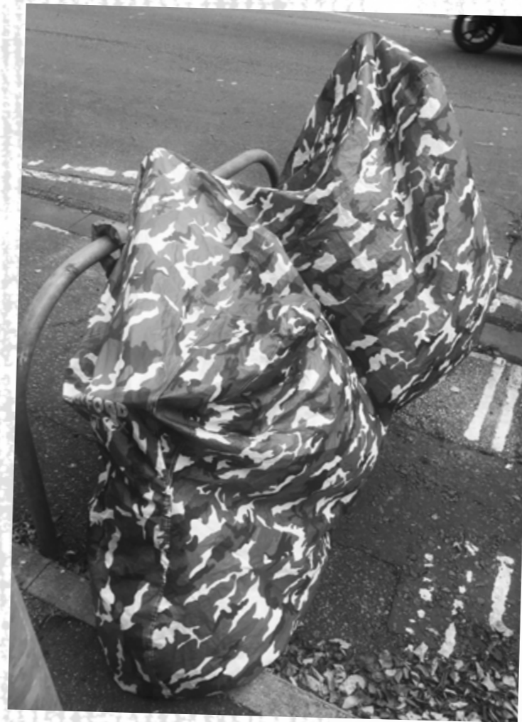
oversized padded jacket with asymmetric fastening