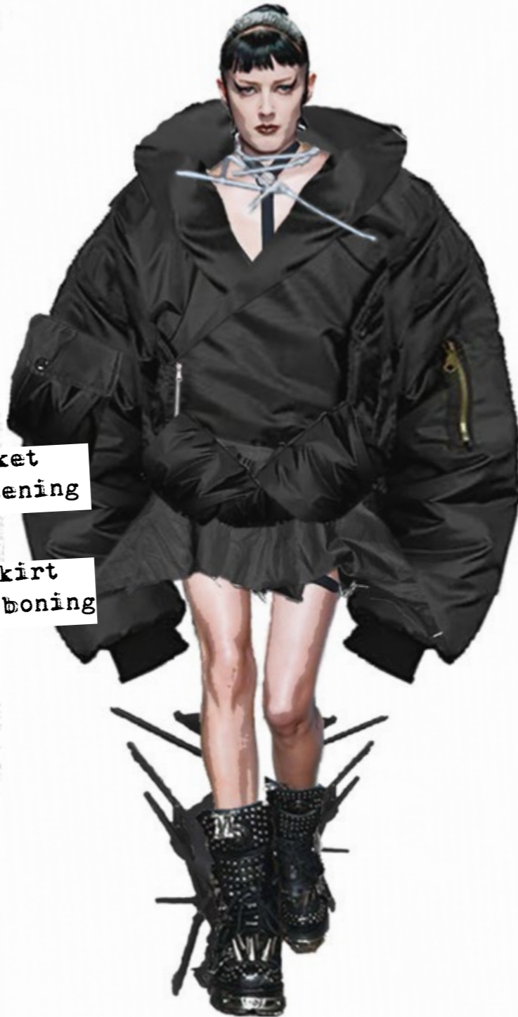
angular nylon mini-skirt with umbrella-style boning